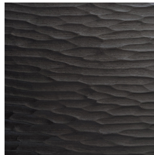
Black Fineline veneer