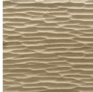
Knob oak Real wood veneer