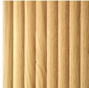
Knob oak Real wood veneer

Straightness: 3,0 mm per Meter Size accuracy: +/- 1,0 mm per Meter Thickness allowance: +/- 0,5 mm Exactitude of profile: +/- 1,5 mm