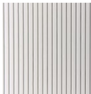
Lacquerable foil *