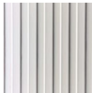
Lacquerable foil *