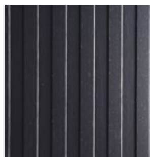
Black Fineline veneer