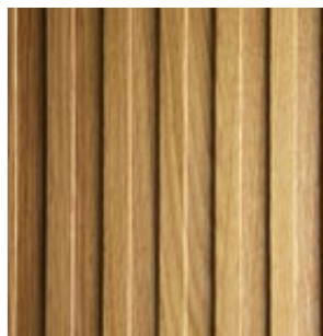
Knob oak Real wood veneer