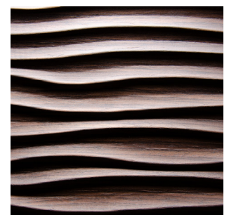
Oak chocolate Fineline veneer