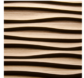
Light Oak Fineline veneer