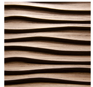
Walnut Real wood veneer