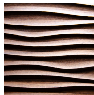
Heartwood walnut Real wood veneer