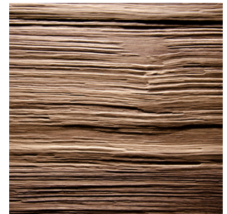
Walnut antique Real wood veneer