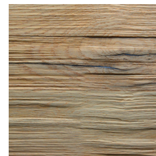
Old Oak Real wood veneer