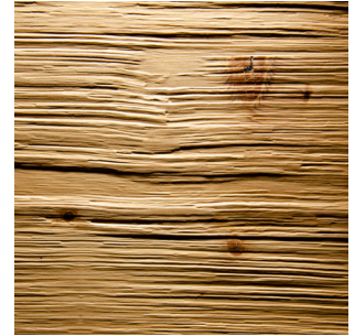
Spruce antique Real wood veneer