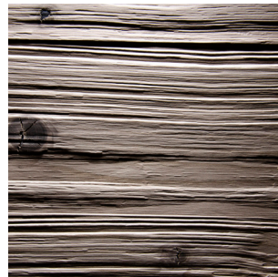
Antique grey Real wood veneer