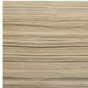
Knob Oak Real wood veneer

Straightness: 3,0 mm per Meter Size accuracy: +/- 1,0 mm per Meter Thickness allowance: +/- 0,5 mm Exactitude of profile: +/- 1,5 mm